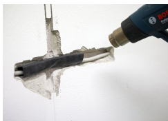
Heat the shrink tube and properly reclose the damaged area.