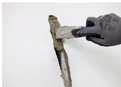
Close the damaged area discreetly.