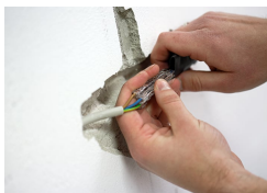
Connect the cable using the cable repair kit.