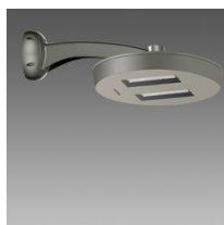
3328 Visconti 2.0 - street ME