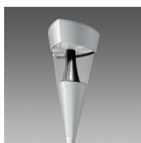
1707 Torcia LED