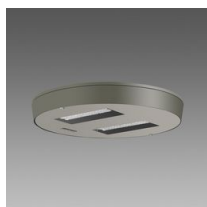
3327 Visconti 2.0 - street ME