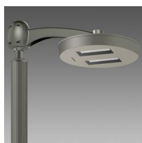
3329 Visconti 2.0 - street ME