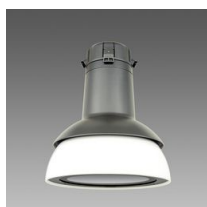
3143 Campana LED