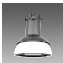
3146 Campana LED