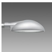
1756 Monza HP - high performance