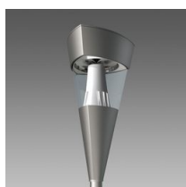
1513 Torcia LED COB