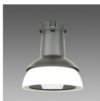
3142 Campana LED