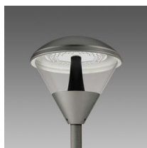
1518 Clima LED against light pollution