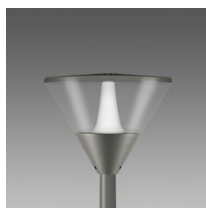
1570 Clima - LED