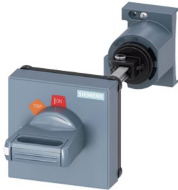
Door-coupling rotary operating mechanism For circuit breaker Size S00...S3, black 130 mm shaft