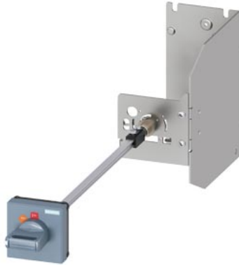
Door-coupling rotary operating mechanism for harsh conditions For circuit breaker Size S2 Handle gray