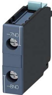
front-side auxiliary switch, 1 NO, leading, screw terminal, for contactors 3RT1