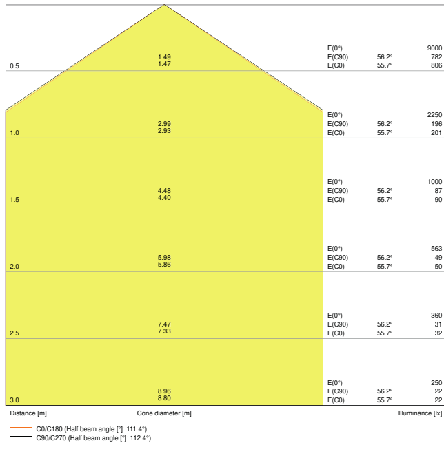
LDC typ cone