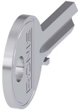
Key for RONIS key-operated switch, Lock No. SB30