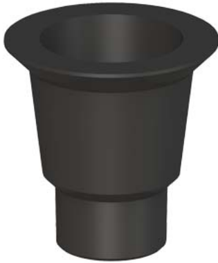
Pipe adapter, for mounting on pipes, black, accessories for built-in lamps, with diameter 70 mm