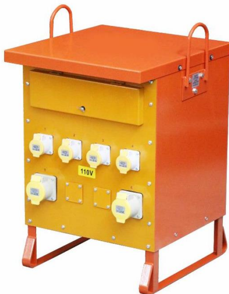
Installation Instructions for Site Transformer 10KVA 3PHASE TRANSFORMER CONNECTION DIAGRAM