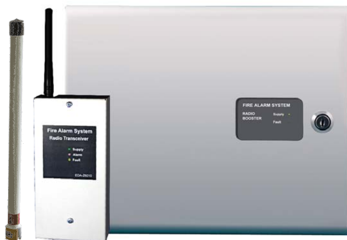
Image shows; from left to right F/EDA-Y5000 , F/EDA-Z6010 & F/EDA-Z6000

This antenna replaces the stubby type antenna supplied with the EDA-Z5008 & EDA-Z5020 panels and is designed to increase the signal strength of the wireless fire alarm system.