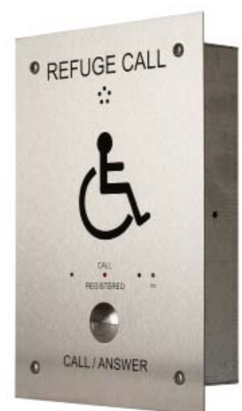
Images shows from left to right R/CH/RCO/H/GB & - R/CH/RCO/H/SS/1