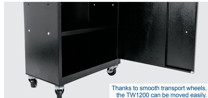
Thanks to smooth transport wheels, the TW1200 can be moved easily.