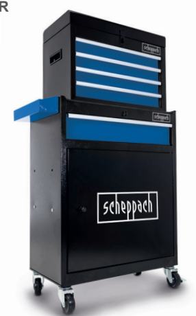
The TW1200 is suitable for versatile use, thanks to its compact design.