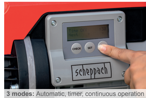
3 modes: Automatic, timer, continuous operation