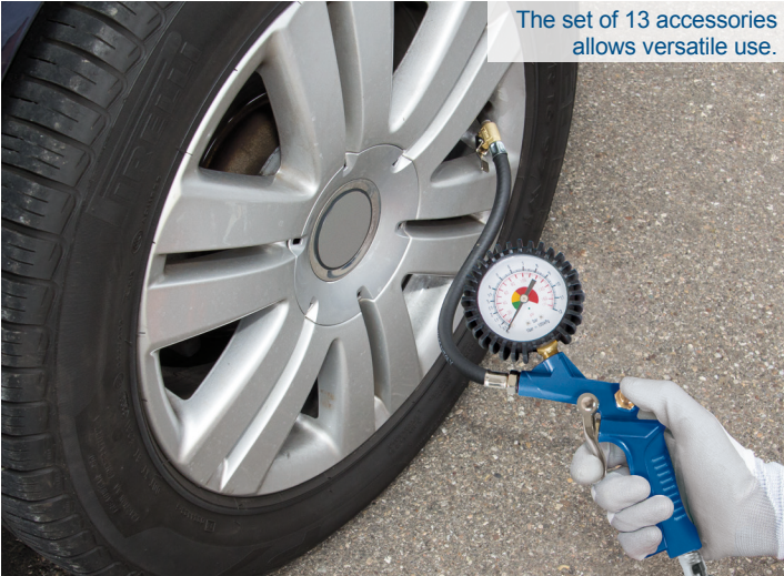
The set of 13 accessories allows versatile use.