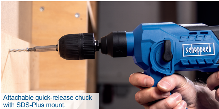
Attachable quick-release chuck with SDS-Plus mount.

ensures perfect illumination even in poor lighting conditions