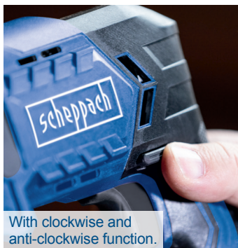
With clockwise and anti-clockwise function.