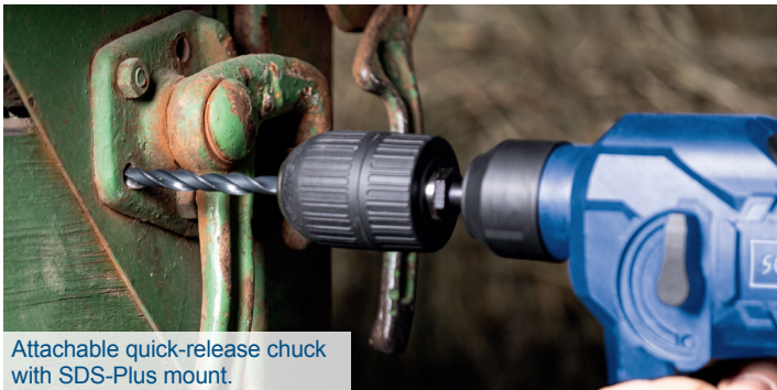
Attachable quick-release chuck with SDS-Plus mount.