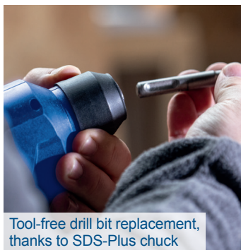
Tool-free drill bit replacement, thanks to SDS-Plus chuck