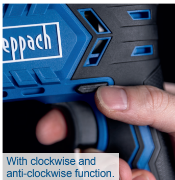
With clockwise and anti-clockwise function.