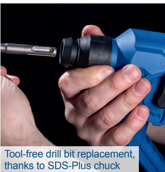
Tool-free drill bit replacement, thanks to SDS-Plus chuck