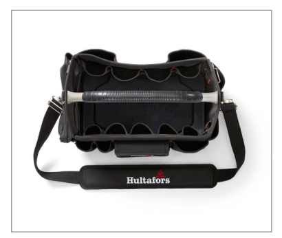
Open toolbox with 25 pockets.