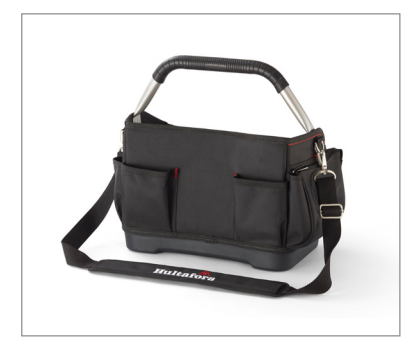
Ergonomically curved back for easier carrying.