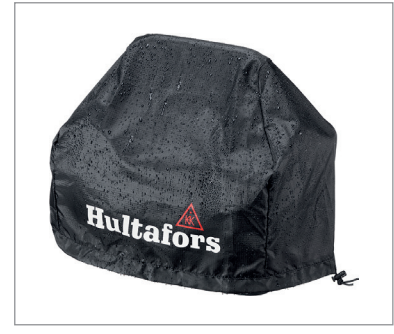
Rain and dust cover included.