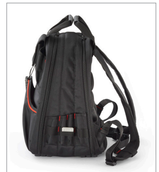
3D-shaped shoulder straps.