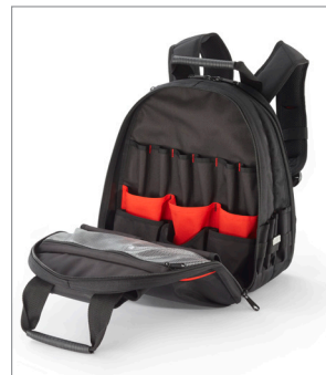
Backpack with 48 pockets.