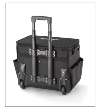
Telescopic aluminium handle.