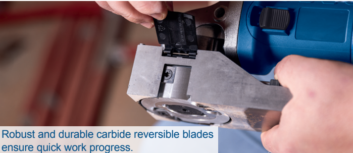
Robust and durable carbide reversible blades ensure quick work progress.