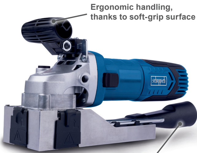
Ergonomic handling, thanks to soft-grip surface