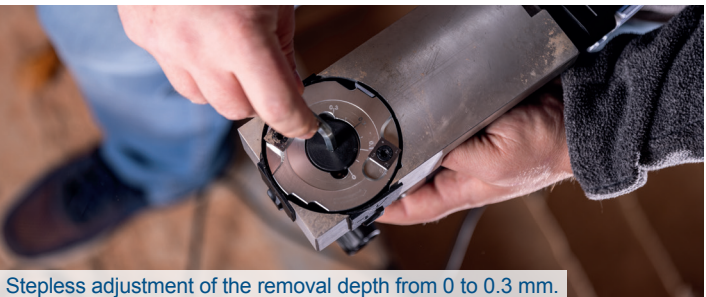
Stepless adjustment of the removal depth from 0 to 0.3 mm.

Up to 70% time saved compared with conventional working techniques.