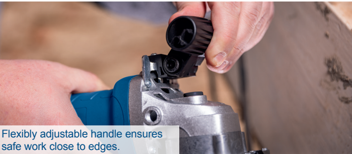
Flexibly adjustable handle ensures safe work close to edges.