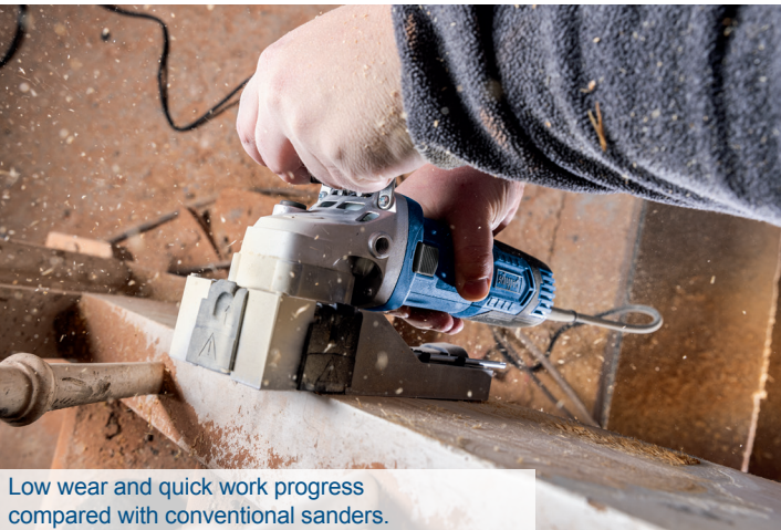
Low wear and quick work progress compared with conventional sanders.