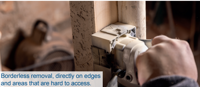
Borderless removal, directly on edges and areas that are hard to access.