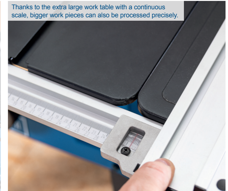
Thanks to the extra large work table with a continuous scale, bigger work pieces can also be processed precisely.