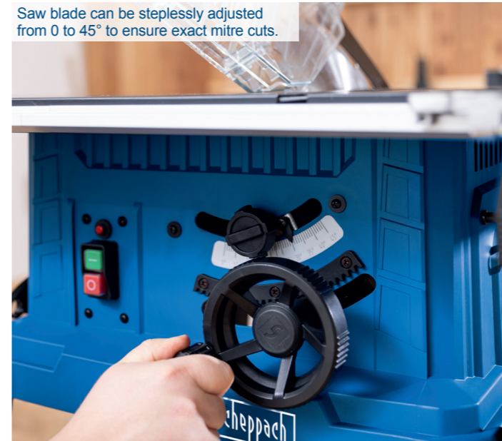
Saw blade can be steplessly adjusted from 0 to 45° to ensure exact mitre cuts.