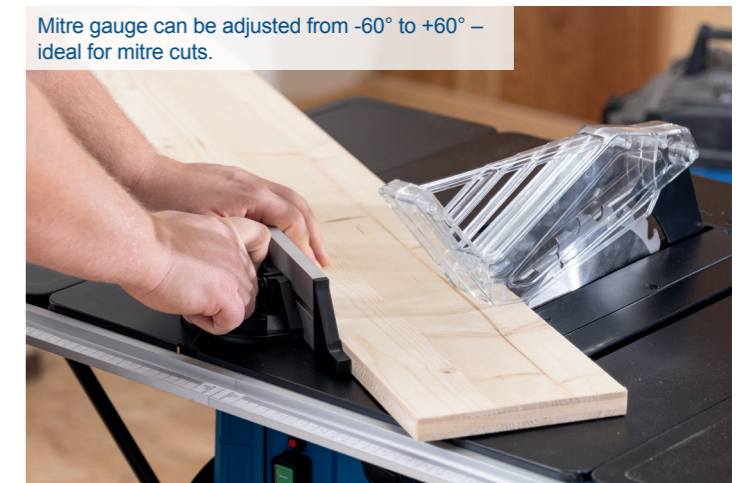
Mitre gauge can be adjusted from -60° to +60° – ideal for mitre cuts.