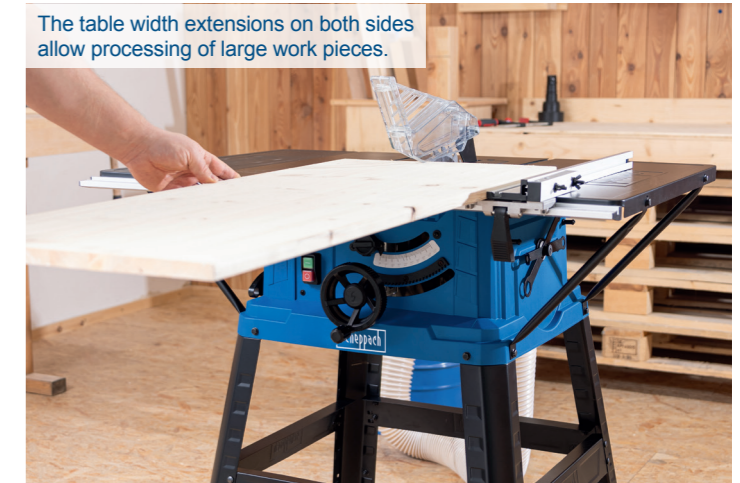
The table width extensions on both sides allow processing of large work pieces.