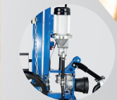
HL3000GM (Motor + PTO)