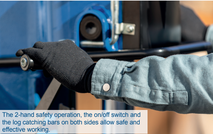
The 2-hand safety operation, the on/off switch and the log catching bars on both sides allow safe and effective working.