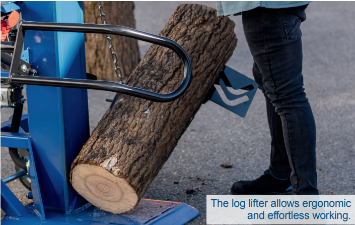
The log lifter allows ergonomic and effortless working.