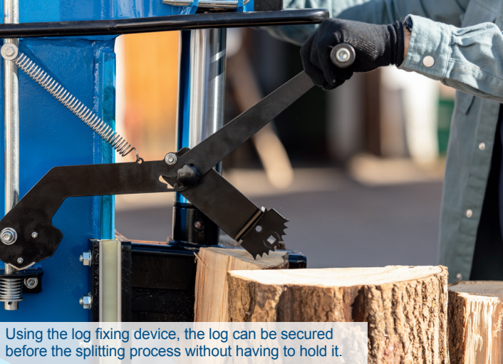
Using the log fixing device, the log can be secured before the splitting process without having to hold it.