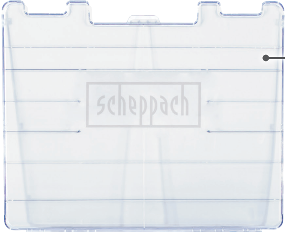
Plastic carry case