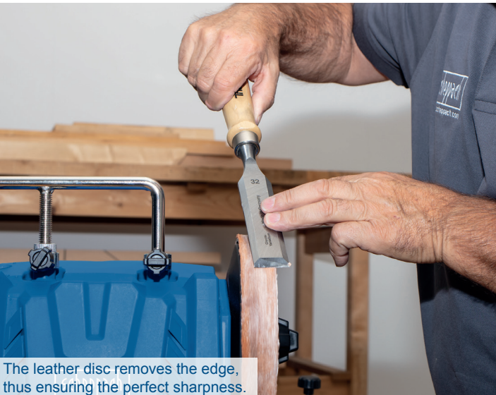
The leather disc removes the edge, thus ensuring the perfect sharpness.