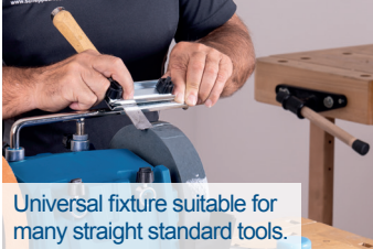
Universal fixture suitable for many straight standard tools.