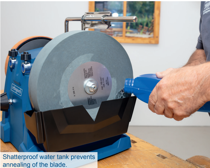
Shatterproof water tank prevents annealing of the blade.