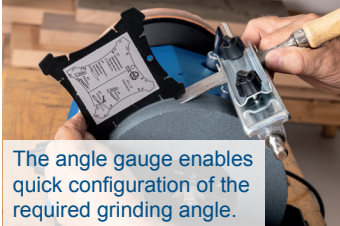
The angle gauge enables quick configuration of the required grinding angle.