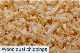
Wood dust chippings