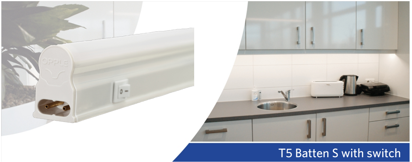
T5 Batten S with switch