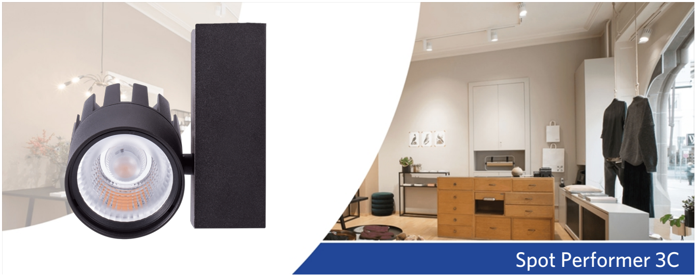
Spot Performer 3C