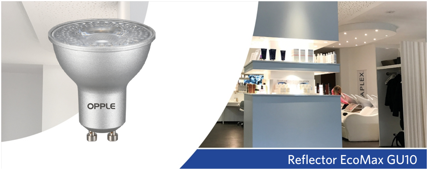
Reflector EcoMax GU10