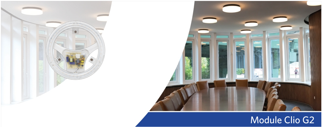
Module Clio G2