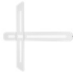
520098001800 LED Apollo HC350 bracket