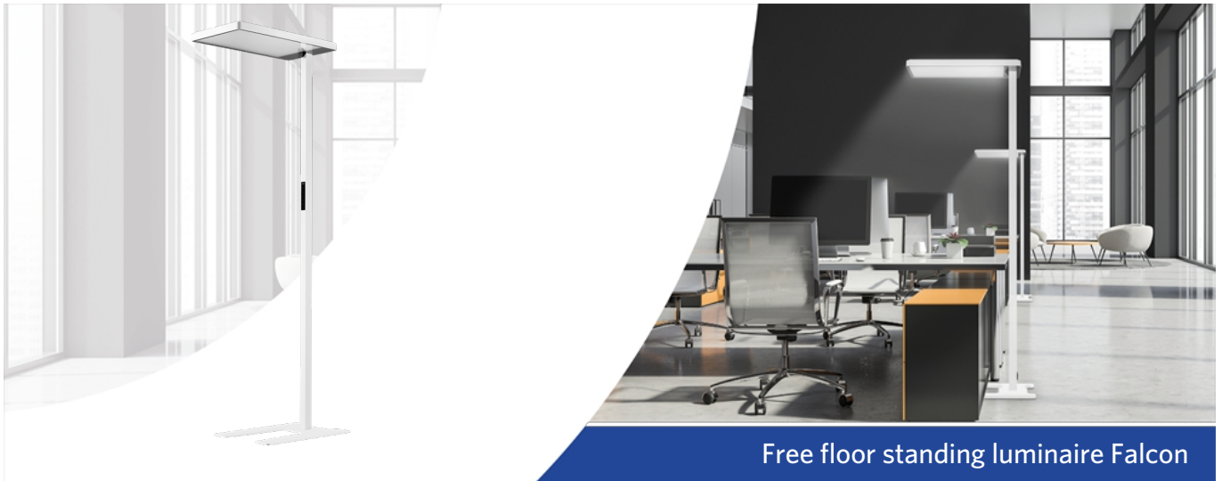
Free floor standing luminaire Falcon