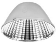
550098000300 LEDSpot3C-C-P R85-Reflector-24D