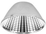
550098000500 LEDSpot3C-C-P R100- Reflector-24D