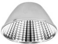
550098001000 LEDSpot3C-C-P R65-Reflector-24D