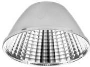
541001187900 LEDSpot3C-C-CS R68-Reflector-24D