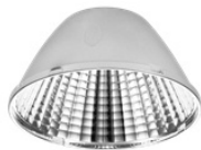
541001187800 LEDSpot3C-C-CS R47-Reflector-24D