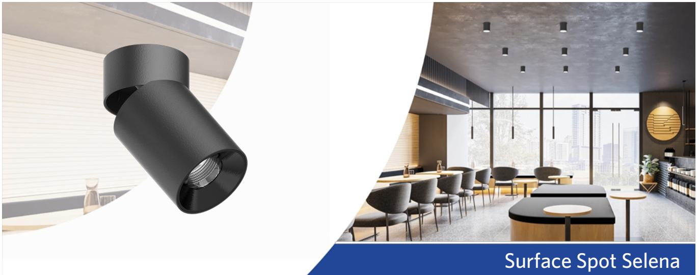
Surface Spot Selena