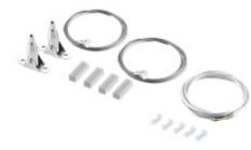
599006009000 LEDLima Suspension-Kit