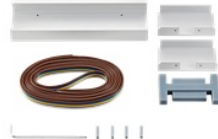
599006008900 LEDLima Connection-Kit