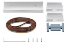
599006008900 LEDLima Connection-Kit