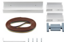
599006008900 LEDLima Connection-Kit