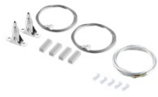
599006009000 LEDLima Suspension-Kit