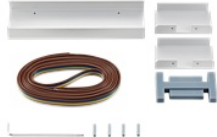
599006008900 LEDLima Connection-Kit