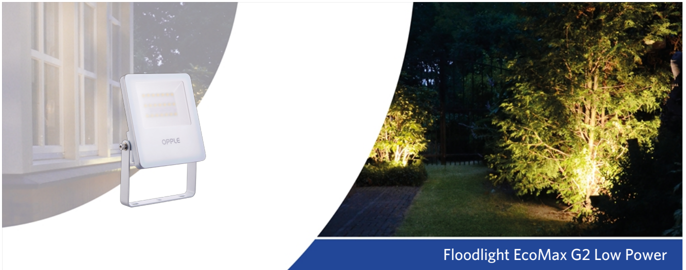
Floodlight EcoMax G2 Low Power