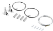
599006009000 LEDLima Suspension-Kit