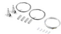
599006009000 LEDLima Suspension-Kit