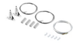
599006009000 LEDLima Suspension-Kit