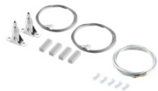
599006009000 LEDLima Suspension-Kit