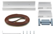
599006008900 LEDLima Connection-Kit