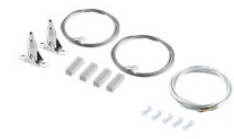
599006009000 LEDLima Suspension-Kit