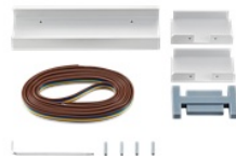
599006008900 LEDLima Connection-Kit