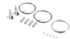
599006009000 LEDLima Suspension-Kit