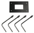
703098000300 LEDBollard-Luke-E Concrete-Mounting-Kit