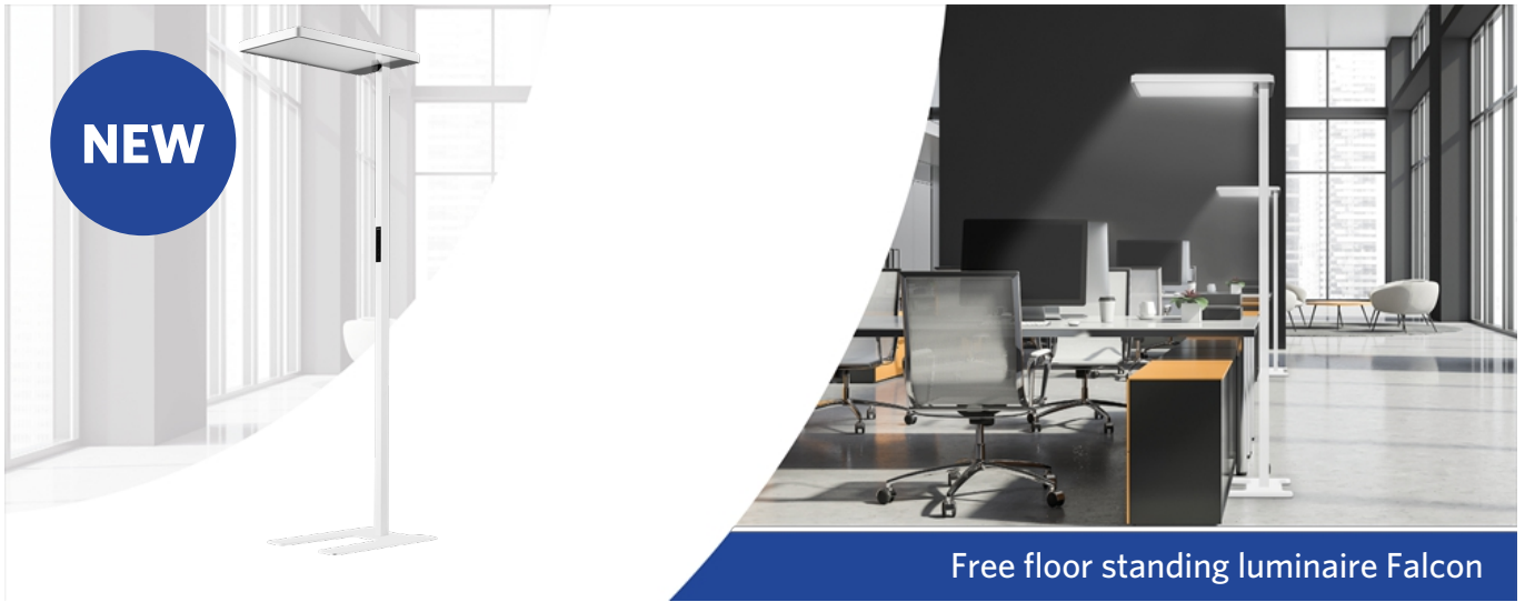
Free floor standing luminaire Falcon